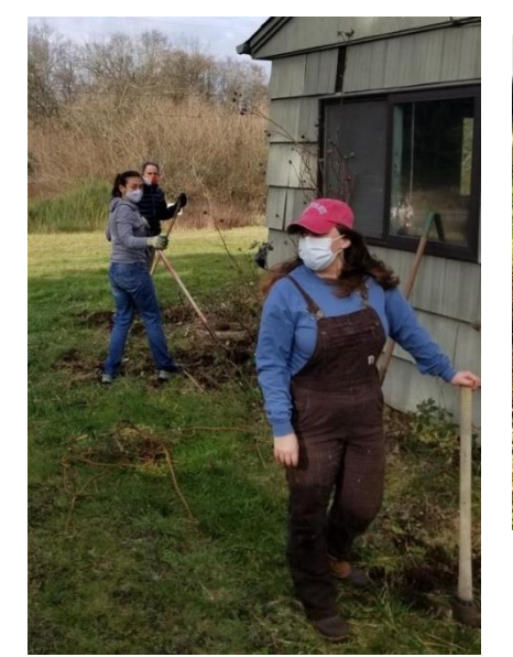
Suyematsu-Bentryn Farm Stand 2020 Sales