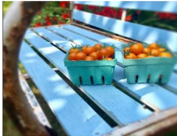
Quantification of Produce and Products in 2019 Quantities are in pounds unless otherwise indicated

As they have for many years, farmers on public land, including Bainbridge Island Farms, Butler Green Farms, and Laughing Crow Farms, and Vireo Farm give back to benefit our vulnerable populations through regular donations of fresh, healthy food to the foodbank at Helpline House.